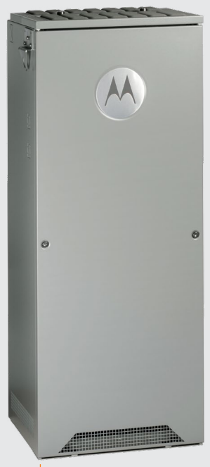
DIMETRA EXPRESS MTS4 TETRA SYSTEM